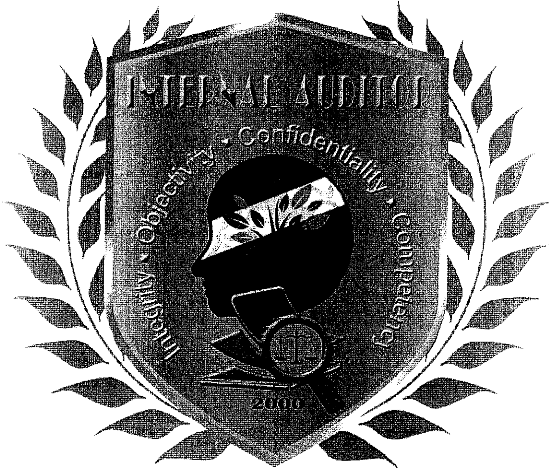
SENIOR INTERNAL AUDITOR BADGE