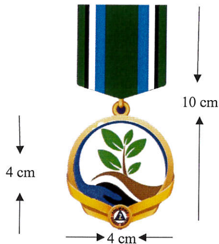
Figure 1. KASAGABAY Medal