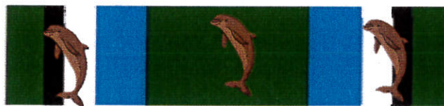
Figure 6. 4 th Deed