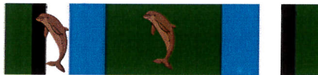
Figure 5. 3 rd Deed