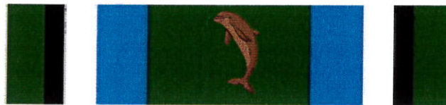
Figure 4. 2 nd Deed